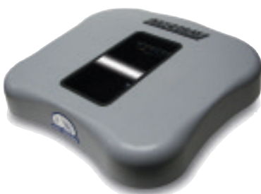
Package does not include a computer.