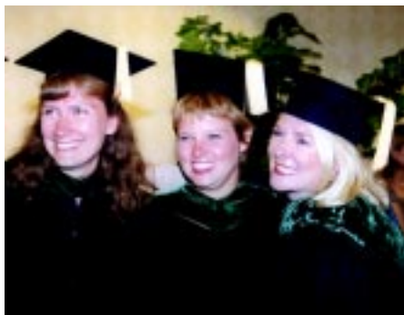
Three happy Diplomates at 2000 Commencement in Orlando, Florida.

The Diplomate in Chiropractic Pediatrics of the ICA Council on Chiropractic Pediatrics (DICCP) is a credential that is becoming recognized by the consumer as well as the media. It is the only Board Certified credential in pediatrics in the chiropractic profession. The 360-hour, 3-year program is currently administered through Palmer College of Chiropractic in various cities with many of the beginning modules available on-line. Doctors must complete the required course of study through Palmer College and be declared "board eligible" before they can sit for the Diplomate Board examination of the ICA Council on Chiropractic Pediatrics. Only D.C.s who pass this Board examination