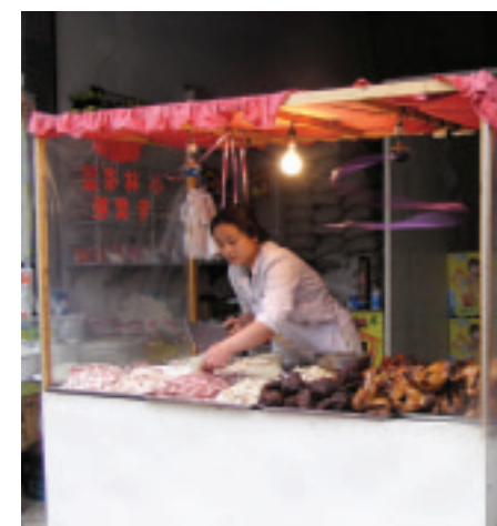
An eatery the American delegation found unique but delightful — food cooked outside on an open fire and served hot!