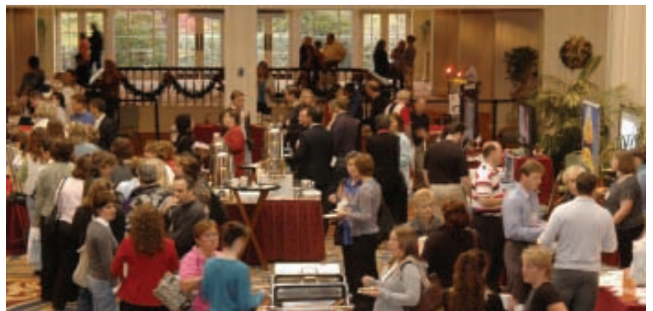
Attendees use the time during the breaks to help themselves to refreshments, visit with one another, or check out the exhibits.