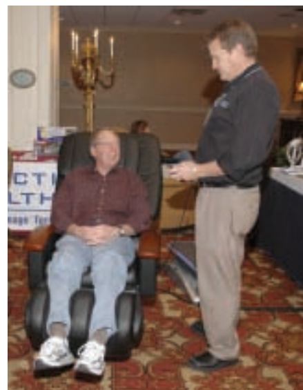
On the exhibit floor a doctor tries out one of the massage chairs, some browse through books on display and others find out more about products and services from the vendors