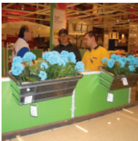
Shopping for office furnishings at Ikea

doctor's offices are lacking. They usually look and feel very "cold" and uninviting. We want to change that stereotype. We purchased rugs for the floor, a corner desk, some frames for the chiropractic posters, a very nice Da Vinci's "perfect man" for the wall, a curtain to separate the two rooms and a couple of other things. We took a few of the items with us and had the rest to be delivered to the hospital within the next two days.