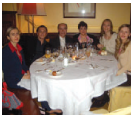
Enjoying a traditional "Russian Dinner" the night before my friends and colleagues have to return home and I stay behind to start my new life and work in St. Petersburg.

Much work and support is still needed on this project. More clinics