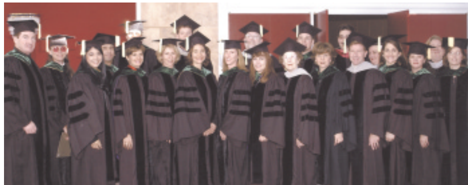
A happy group of the Class of 2001 after their commencement in Colorado Springs. They are now Board certified and entitled to use the D.I.C.C.P. (Diplomate of the ICA Council on Chiropractic Pediatrics) credential.

Congratulations to the 22 doctors who became Board Certified in Chiropractic Pediatrics in 2001 and now join 100 of their colleagues in the USA and Canada with this special qualification.