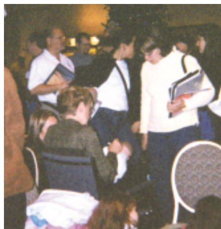
Doctors line up for a book signing and to get additional help on cranial adjusting, using a doll as a model.

The ICA Pediatrics Council has also reached out to other professionals in the health care field who care about children, educating them about chiropractic care for children and building bridges of communication for the benefit of the patient.