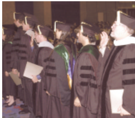
Doctors take the oath to honor and serve their little patients with the best care possible and to maintain the integrity of the profession at all times.

The Diplomates in Chiropractic Pediatrics (DICCP) are much in demand by consumers thanks to positive coverage by the media in newspapers and journals starting with the inauguration of the first graduating class in 1996. It takes three years to complete the program,