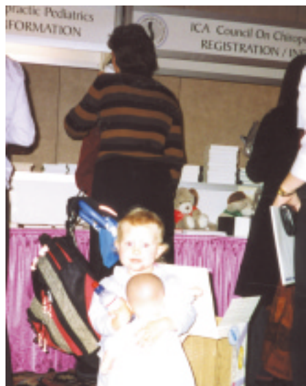
The ICA Pediatrics Council booth was a popular place for information and purchase of publications and products.