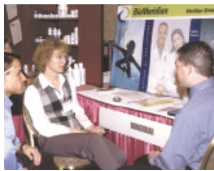
Vendors are pleased to answer questions about their products and services.