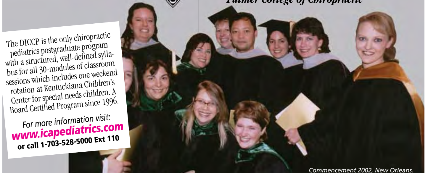
Commencement 2002, New Orleans.